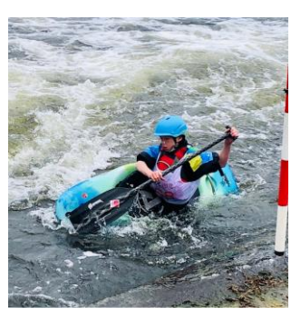
3rd place 'Determination' by Louise Horsley "Good action with frozen water"

Quotes were taken from the feedback provided by the photography club.